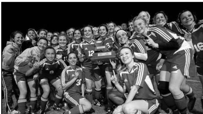
The 2009 Girls Varsity Soccer Team takes a time out to pose with the championship trophy after winning the state title.