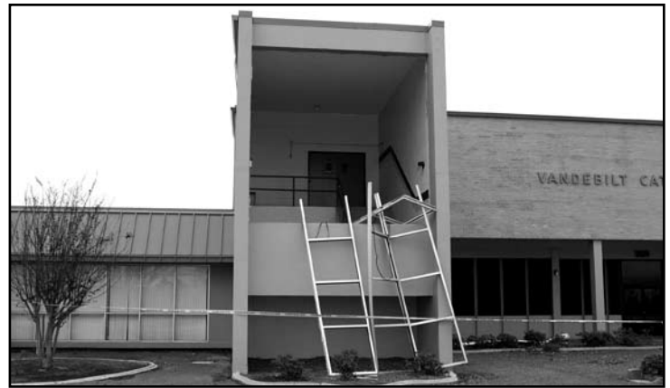
The large window in the front of school was blown out as a result of hurricane Gustav.