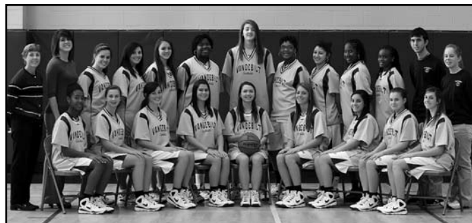
The Varsity Girls Basketball Team played hard this year and earned the title of State Runner up for the 2009 basketball season.